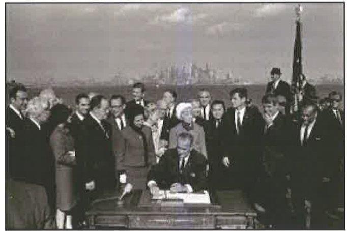
President LBJ signing Immigration Act of 1965; Liberty Island, New York, N.Y., Oct 3, 1965

The economic consequences and the engulfing of the free services are well known. Americans, particularly in urban areas, have seen changes in